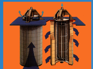
Swing Wing Filter Media