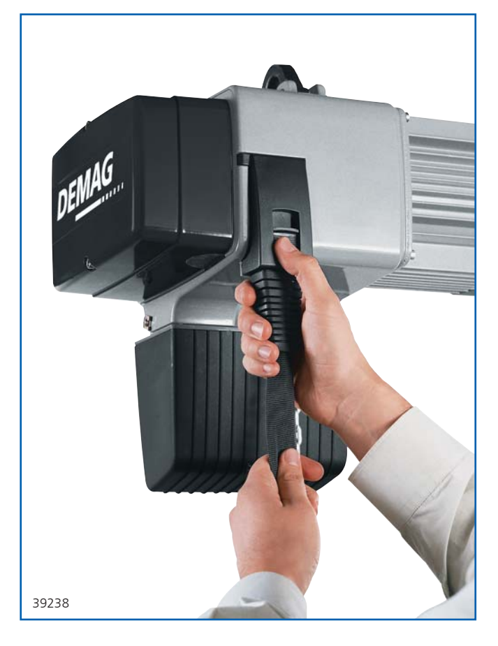
Height-adjustable control cable

The DC-Pro product range offers an extended spectrum of functions and options for a wider range of applications.