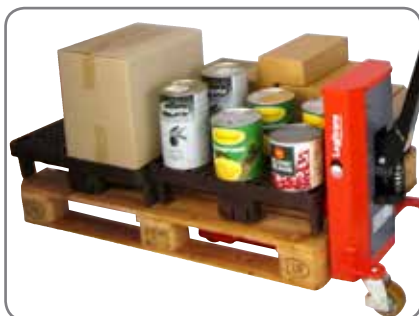
A quarter pallet is lifted from a EUR pallet with LogiQ 300 and can be moved to the location of display in the shop.