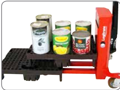
LogiQ 300 can handle the upper quarter pallet without problems.