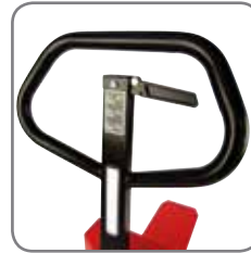
The ergonomically correct gripping angles ensure the user a relaxed grip.