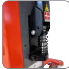
LogiQ 300 has a hydraulic pump, minimising the number of pump strokes.