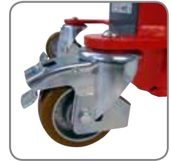
Parking brake on LogiQ 300.