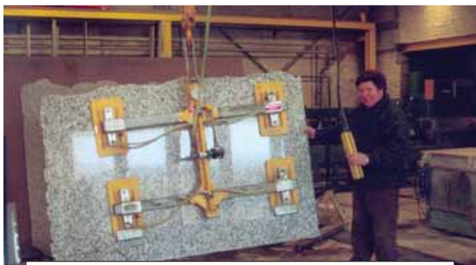
Stone & Glass Handling System Designs

PH: 610-701-6350 ++++++ info@tnthandling.com