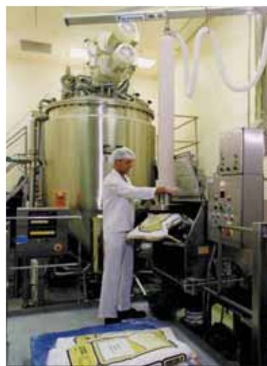
304 SS Cranes, Lifts and Compactors