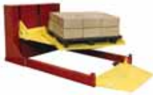
Wide Range of Lift Tables