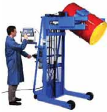
Drum Weigh & Pour