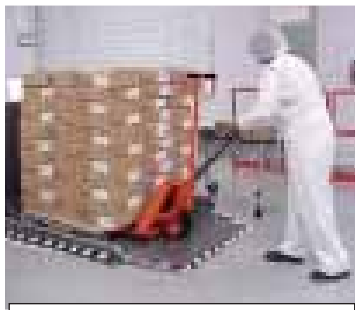
Food Grade Lift Tables