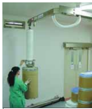
Clean Room Cranes & Lifts