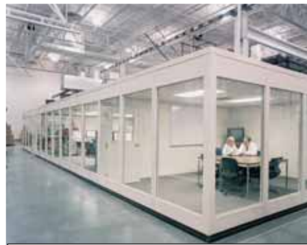
Modular Rooms, Buildings & Offices