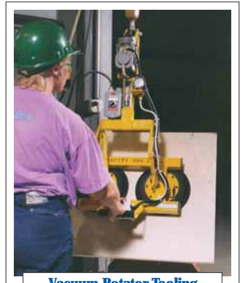
Vacuum Rotator Tooling

Automated Bag Openers Bag Dump Stations Bag Lifters Bulk Bag Unloaders Conveyors Dust Extraction Systems