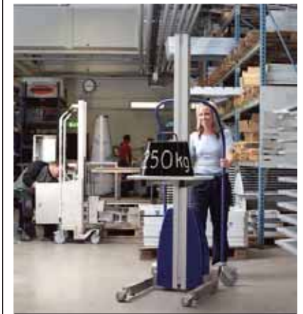
Electric Carts for a range of Applications