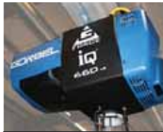
Intelligent Hoist Systems