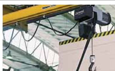
Crane & Hoist Systems