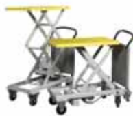
Manual Cart/Lift Table Units