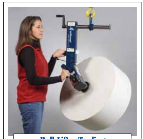
Roll Lifter Tooling