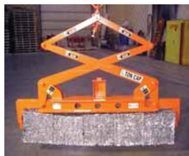
Grabs & Simple Tools for Lifting