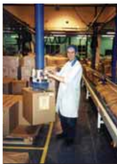
Vacuum Lifting for Palletizing