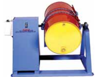
Powered Drum Pouring