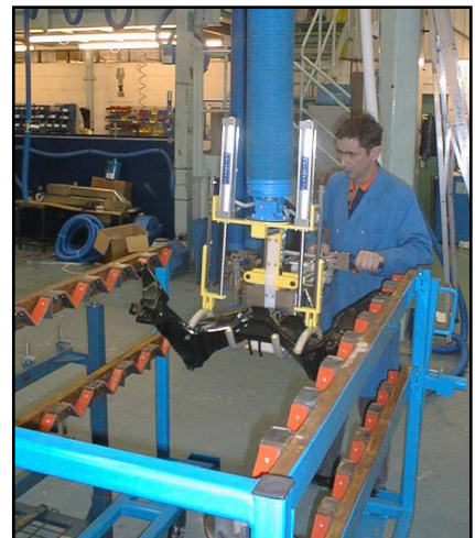
Typical application picking from stillage to stillage with sub frames remaining in vertical (off set) orientation.