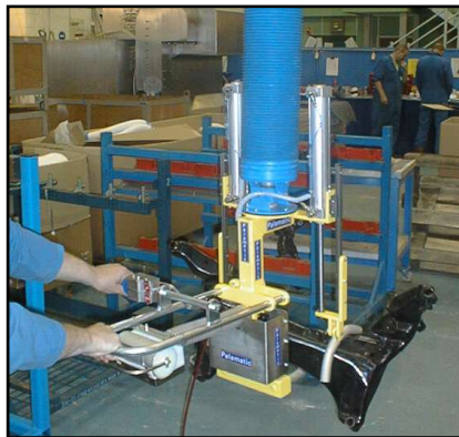
Operator friendly controls are conveniently mounted in one location for ease of use. A specially designed pneumatic gripper secures the sub frames during transfer