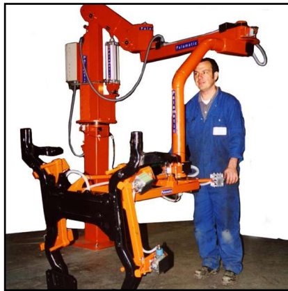
Horizontal Arm Manipulator used to handle 40kg (88lb) sub frames. Unit incorporates 90° pneumatic rotation.