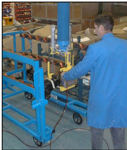
Vacuum Tube Lifter handling 30kg (66lbs) sub frames supported from an overhead gantry with floor mounted support columns.

Palamatic's worldwide sales network ensures that our expertise works for the company and its operatives