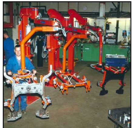
Three identical Horizontal Arm Manipulator units with overall reach of approx. 3m. Typical application handling sub frames from vertical to horizontal.