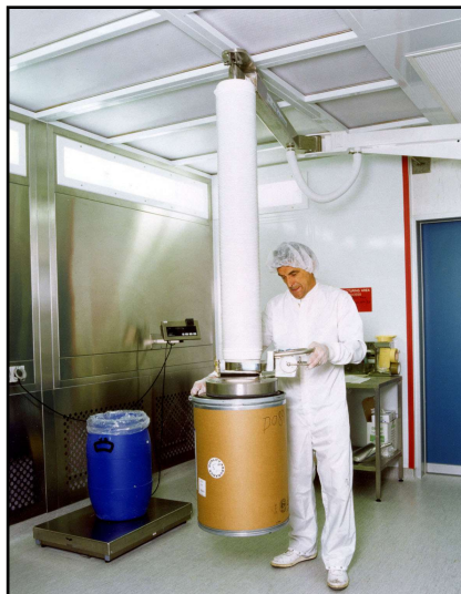
Palamatic Vacuum Tube Lifter. Effortless and safe handling of fibre kegs within a dispensary booth

Palamatic's worldwide sales network ensures that our expertise works for the company and its operatives