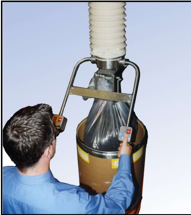
Example of Palamatic's PneuHoist-C (Compact version). Pneumatically actuated gripping jaws are used to securely grip the plastic bag before it is lifted clear of the keg and placed on an adjacent dispensing table.