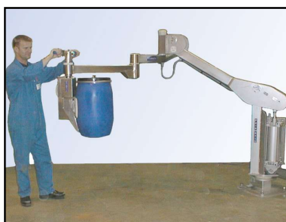
Palamatic Manipulator, low level design suited to operating in containment booths. Stainless steel manufacture with built-in weighing facility