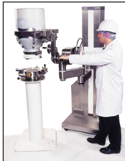
Palamatic Post Hoist. Flexible handling system for kegs, drums and bottles. Excellent mobility for transportation between operating environments