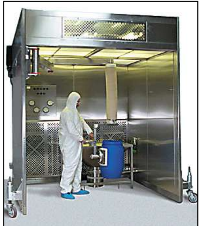
Hygienic drum lifter supported from an articulated (knuckle) style stainless steel crane system all designed to cGMP construction. All components designed for easy maintenance and washdown procedures. The jib is fitted to the reinforced booth wall. Drums can be rotated to pour product into hopper.