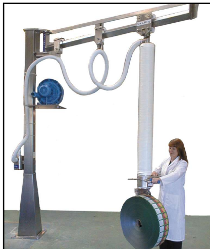
Vacuum Tube Lifter handling 50kg (110lbs) reels supported from a stainless steel floor mounted support column with 3m (10') swing jib

Palamatic's worldwide sales network ensures that our expertise works for the company and its operatives