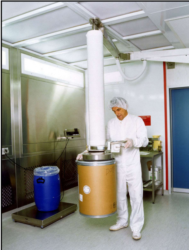
Hygienic Vacuum Tube Lifter handling fibre drums, plastic kegs and sacks supported from a 3m (10') stainless steel ceiling mounted articulated crane. Palamatic's unique low headroom hygienic lifter ensures the operator can achieve the required lift heights within restrictive environments as shown above in a downflow booth.