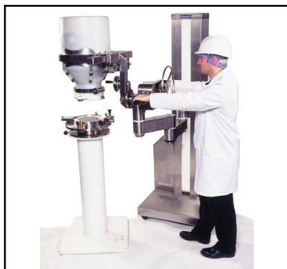
Mobile Pillar Tipper handling plastic containers from pallet, inverting and placing onto a buck valve.