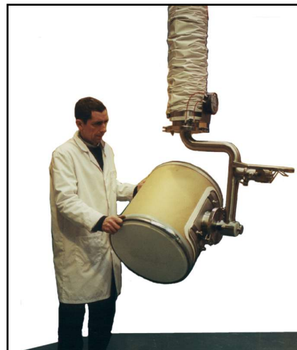
Side vacuum grip of the keg allows the operator to manually tip the product from the keg into a discharge station.