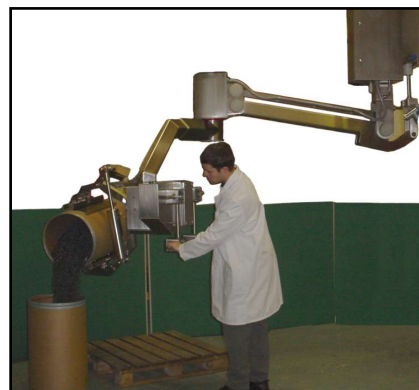
Stainless Steel Manipulator with weighing feature handling plastic drums from a filling head to a pallet.