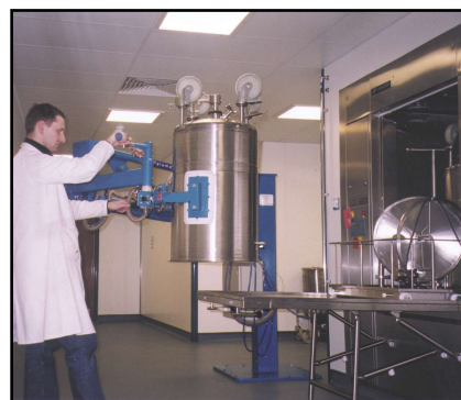
Low level manipulator lifting and inverting stainless steel vessels and feeding into washing machine.

We would like to thank to Extract Technology and Howorth Airtech for supplying the front cover photos of Palamatic Hygienic Lifters on site.