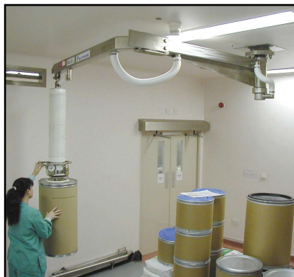
Fibre keg, plastic drum and sack handling vacuum lifter supported from a ceiling mounted 360° rotational articulated arm, manufactured in 304 stainless steel.