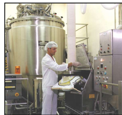
Wall mounted swing jib arrangement and vacuum tube lifter handling sacks from a pallet into a sack tip booth.