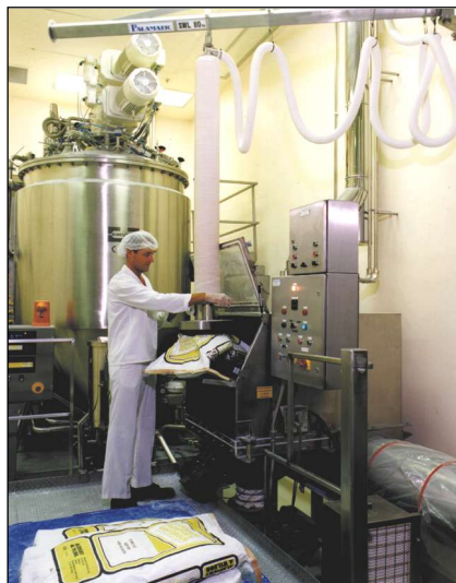
Example - Vacuum Tube Lifter; shown here using a flexible rubber seal to grip and lift the porous sacks. Ideal for palletising or depalletising of paper and plastic sacks.