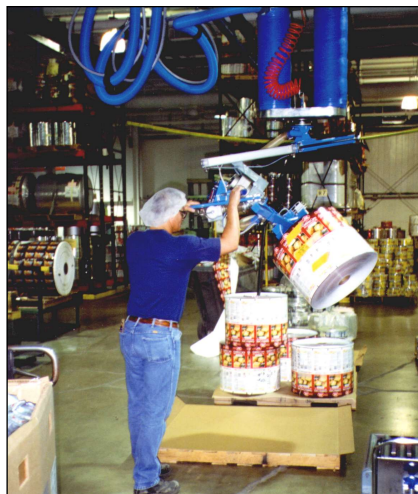
Example - Vacuum Tube Lifter; reels of packaging material picked, lifted and rotated using a Vacuum Tube Lifter. Reels weigh approx. 80kgs and required two men to handle them before the installation of this system.

Palamatic's worldwide sales network ensures that our expertise works for the company and its operatives