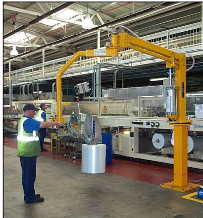
Example - Manipulator; this pneumatically powered system helps the operator to load/unload 60kg reels from pallet to Kister machine. Reels are rotated 90°.