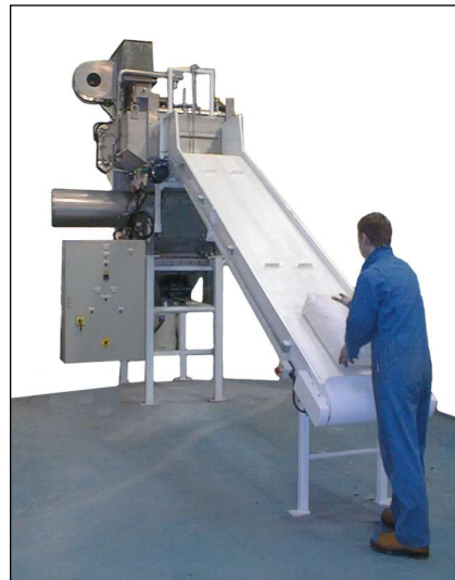
Example - Automatic Sack Discharging Machine; paper, plastic, hessian and polywoven sacks weighing up to 80kg can be cut open and the contents discharged in a dust tight operation, which can increase process throughput and improve product retrieval.