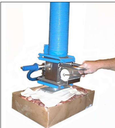
Left: A specially designed suction device lifts directly on the surface of frozen meat blocks. Once again a Vacuum Tube Lifter is used to safely grip and raise the load in a user friendly, one man operation. Right: This handling device was developed to lift multiple tins of evaporated milk. The loading or unloading of the four tin layers is carried out in a fraction of the time taken in doing the process manually. This significantly increases process throughput speed and eliminates damage to the product . The Vacuum Tube Lifter is used again to maximise speed of operation.