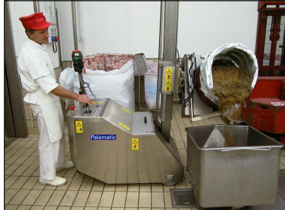
Palamatic design and manufacture a variety of handling systems for the many sectors of the Food industry. These three examples show the flexibility and diversity of our range. Left our Hygienic Vacuum Tube Lifter (lifting sacks of flour) is specially designed for cleandown. Above shows the powered Pedestrian Truck , ideal for drum pouring. Right cheese block handling using a Vacuum Tube Lifter .