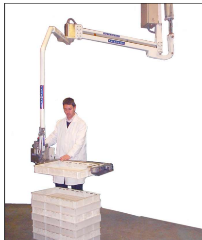
Example - Manipulator; used here to grip and lift trays of pastels weighing 15kg. A built in rotation feature (push button operated) was used to empty the pastels into a coating machine.