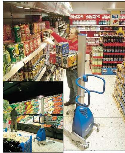
Example - StackerTrolley; simple, easy to manoeuvre trolley with battery powered raising tray. Up to 150kg capacity, this unit is ideal for shelf stacking type operations and accesses narrow aisles with ease.