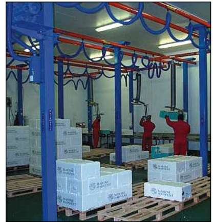
Example - Vacuum Tube Lifters; this system installed in the Fisheries sector enables operator to stack 45kg boxed salmon up to six layers high on pallets.