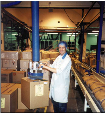
Example - Vacuum Tube Lifter; this system helps the operator to move boxes and sacks weighing up to 40kg from conveyor line to pallet stack.

ELIMINATE MANUAL HANDLING... WEIGHTLESS MOVEMENTS... INCREASED SPEED OF PROCESS... SINGLE OPERATOR CONTROL... LOW MAINTENANCE... IMPROVED SAFETY OF OPERATION... IMPROVED OPERATOR DEPLOYMENT... REDUCE PRODUCT DAMAGE... QUICK DELIVERY... UK MANUFACTURED