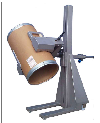
Example - LoadAssist; a mobile stacker trolley with battery powered raising and lowering. Can be used with reel and drum handling attachments or a simple tray for tote bins etc. Lifting capacity of 150kg and typical raising height of 2000mm.