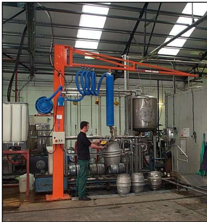
Palamatic provided a solution at the Black Sheep Brewery for handling full casks. Horizontal casks are turned upright and then palletised.

ELIMINATE MANUAL HANDLING... WEIGHTLESS OPERATION... INCREASED SPEED OF OPERATION... SINGLE OPERATOR... LOW MAINTENANCE... IMPROVED SAFETY OF OPERATION... IMPROVED OPERATOR DEPLOYMENT