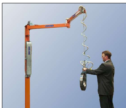
Universal cable hoist, which is an ideal handling system in low headroom environments.