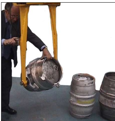
Left: A specially designed pneumatic gripper secures the kegs during the emptying process. Suitable for beer destruction, recycle or stacking. Operator friendly controls are conveniently mounted in one location for ease of use.