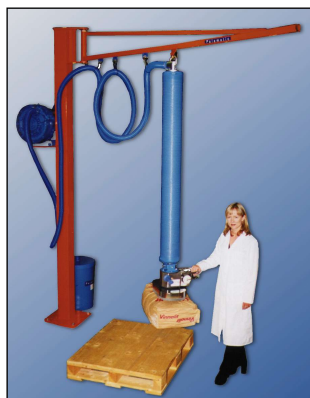
Vacuum Tube Lifter handling sacks