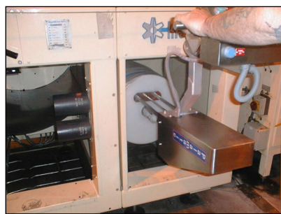
This Palamatic Manipulator was specially developed to load reels onto Kister machines. The reel is lifted and rotated 90° along with push and retract reel feature to prevent any operator interface. Shown above is an on site picture of the confined space into which the reels are lifted.