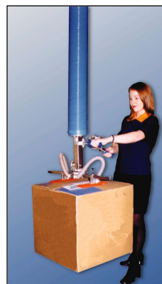
Vacuum Tube Lifter handling boxes