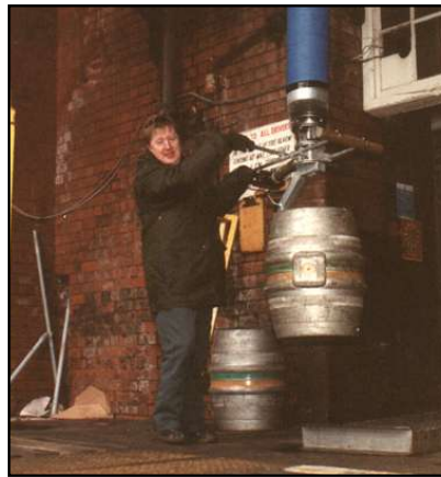
Palamatic's Vacuum Tube Lifter shown here handling 120kg kegs from warehouse to pallet.