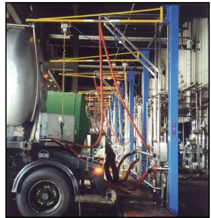
Palamatic helped to provide a solution to this manual handling problem in a tanker loading/unloading area by providing Hoists to lift the 50kg hoses to the tankers.