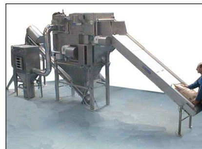
Automatic sack discharging machines which are suitable for handling filter aid such as diatomaceous earth in a dust tight process. An operator exposure level report identified the requirement for contained handling of this carcinogenic product within brewing and wine making industries.