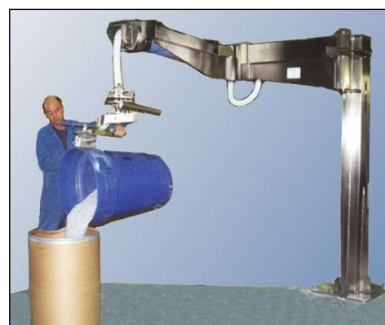
Drum pouring is no problem with our unique Horizontal Vacuum Tube handling device.