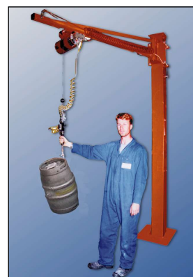
PneuLift 'C' handling kegs