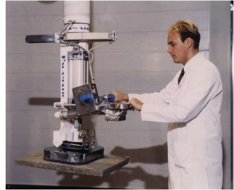
REF NO: REF-VG-008 WEIGHT: 35kg FEATURES: Horizontal to vertical