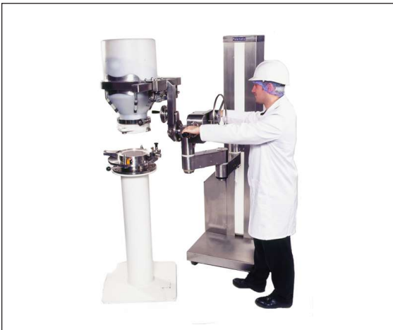
REF NO: MO-PG-003 FEATURES: Mobile PostHoist handling plastic bottles and inverting 180° 304ss construction