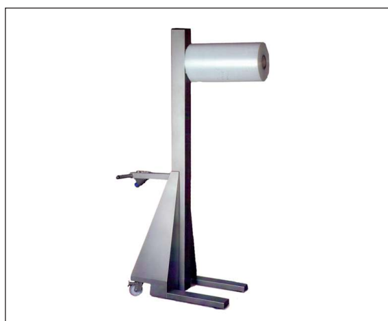
REF NO: MO-MG-006 FEATURES: Load Assist removing reels from spindle and placing on a pallet.