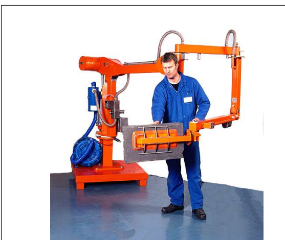
REF NO: MO-VG-005 FEATURES: Mobile manipulator handling 80kg refractory slabs