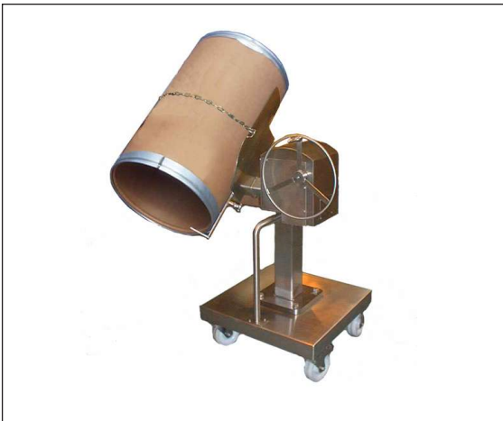
REF NO: MO-MG-001 FEATURES: Mobile drum tipper with geared hand wheel 180° rotation. Manufactured in 304ss