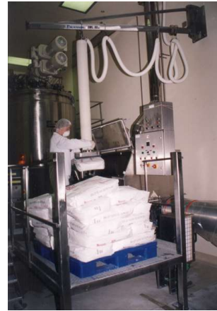
REF NO: G-016 FEATURES: Stainless steel wall mounted bracket and swing jib for food or pharmaceutical industry. Max SWL 160kg