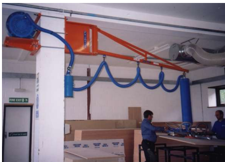
REF NO: G-005 FEATURES: Concrete column mounted bracket with extended clevis and swing jib