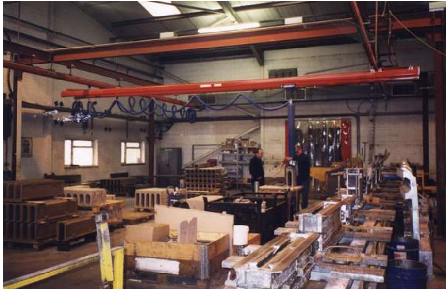
REF NO: G-012 FEATURES: 'H' Style gatry system supported from overhead steelwork