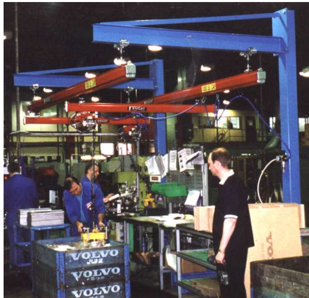
REF NO: G-014 FEATURES: 'H' Style supported from vertical pillars and cantilevered brackets