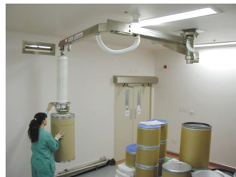
REF NO: G-018 FEATURES: Ceiling mounted 360° stainless steel articulated arm. Max SWL 160kg