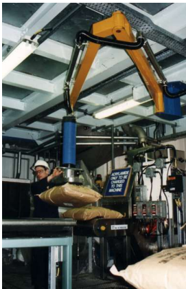
REF NO: G-003 FEATURES: Ceiling mounted clevis bracket and articulated arm