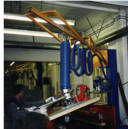
REF NO: G-004 FEATURES: Inverted swing jib for low headroom environments