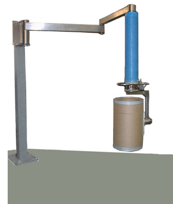
REF NO: G-020 FEATURES: Stainless steel articulated arm with vacuum running through the arm, no visible hose. Ideal for pharmaceutical environments