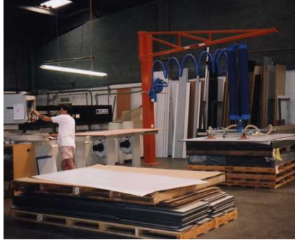
REF NO: G-001 FEATURES: Simple vertical floor mounted pillar with standard swing jib