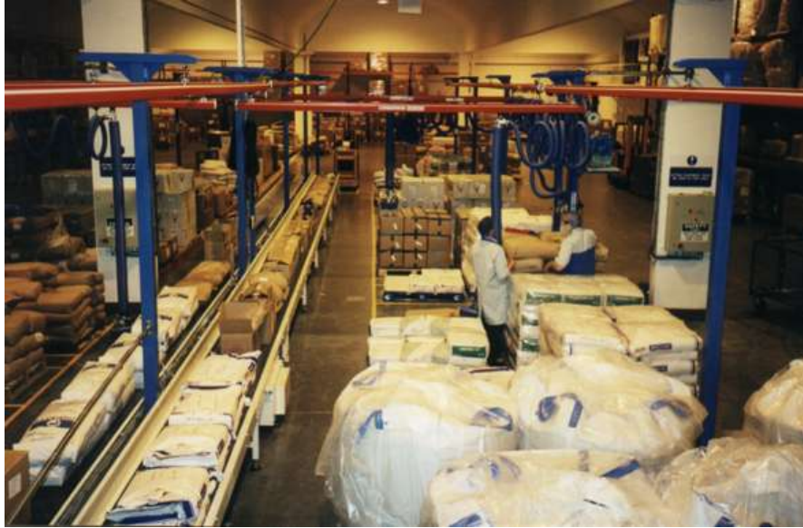
REF NO: G-011 FEATURES: 'H' Style gantry system supported from floor mounted pillars