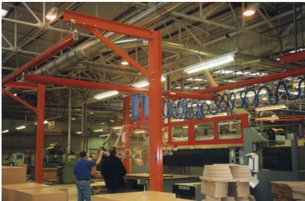
President office Furniture

FEATURES: Ceiling mounted swing jib maximising working floor area