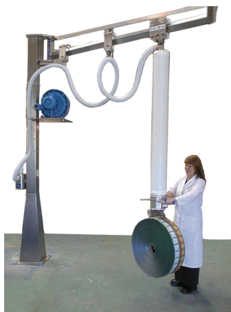
REF NO: G-019 FEATURES: Stainless steel vertical pillar and PalTrac jib. 304ss