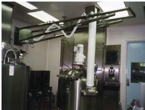
REF NO: G-017 FEATURES: Wall mounted inverted jib with raised top hat to create maximum lift. Max SWL160kg