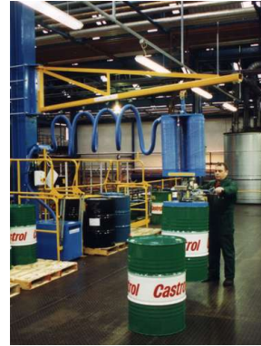
REF NO: G-002 FEATURES: Stanchion mounted bracket and swing jib