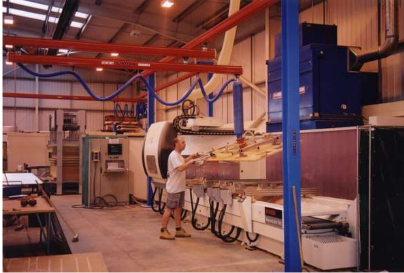
REF NO: G-013 FEATURES: 'H' Style gantry with telescopic bridge beam