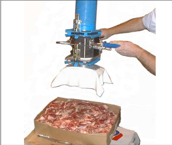
REF NO: F-VG-001 WEIGHT: 10kg FEATURES: Vacuum grip with floppy seal