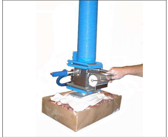
REF NO: F-VG-001 WEIGHT: 10kg FEATURES: Handles irregular shapes