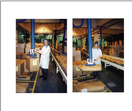
REF NO: F-VG-003 WEIGHT: 12kg FEATURES: Combination sack and box gripper. No need for changeover of feet