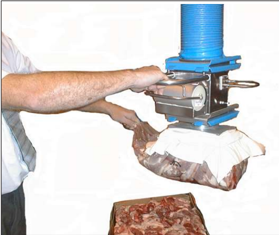
REF NO: F-VG-001 WEIGHT: 10kg FEATURES: Handles meat blocks and sacks