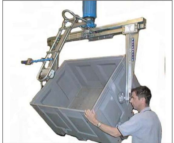
REF NO: F-PG-002 WEIGHT: 50kg FEATURES: Pneumatic grip and turn